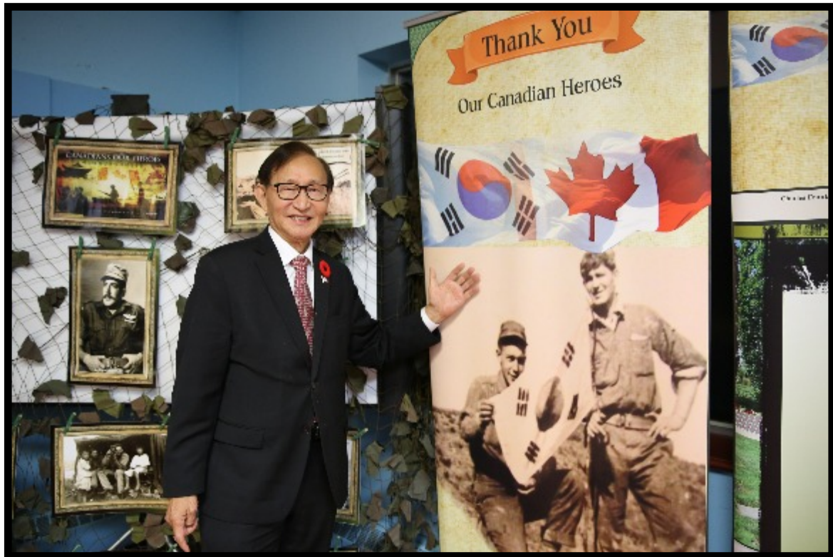
Hon. Raymond Cho Minister of Seniors and Accessibility viewing the various Korean War Photos.