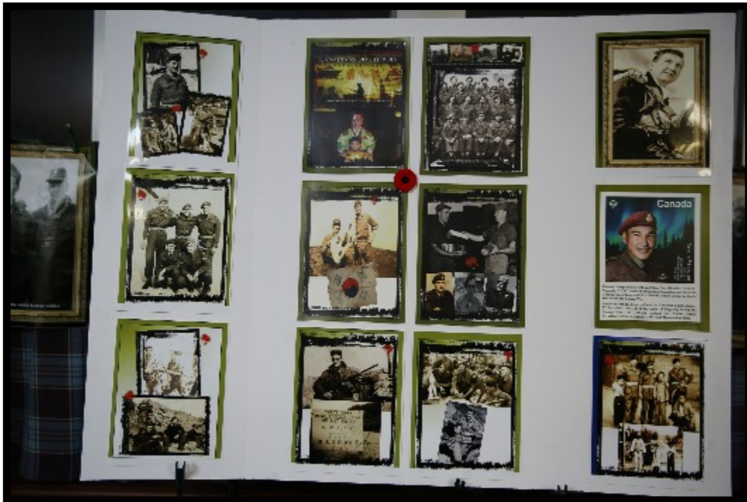
Korean War Photo Exhibition, a brief history of Canadian Army, Royal Canadian Navy and Royal Canadian Air Force.