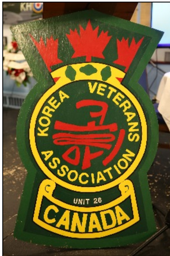
“Korea Veterans Association of Canada Unit 26 sign” (Hand-made by a Korean War Vet)