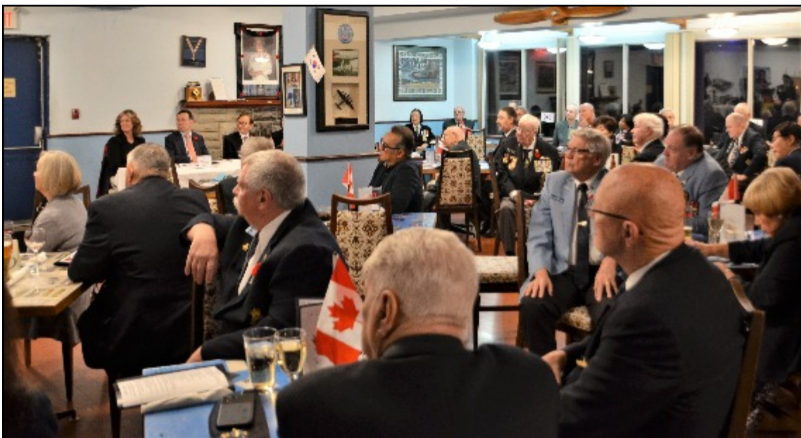
Over 110 guests including dignitaries, Korean War Veterans and their family members, other Veterans (Army, Navy, Air Force) attended the “Korean War Photo Exhibition and Reception”.