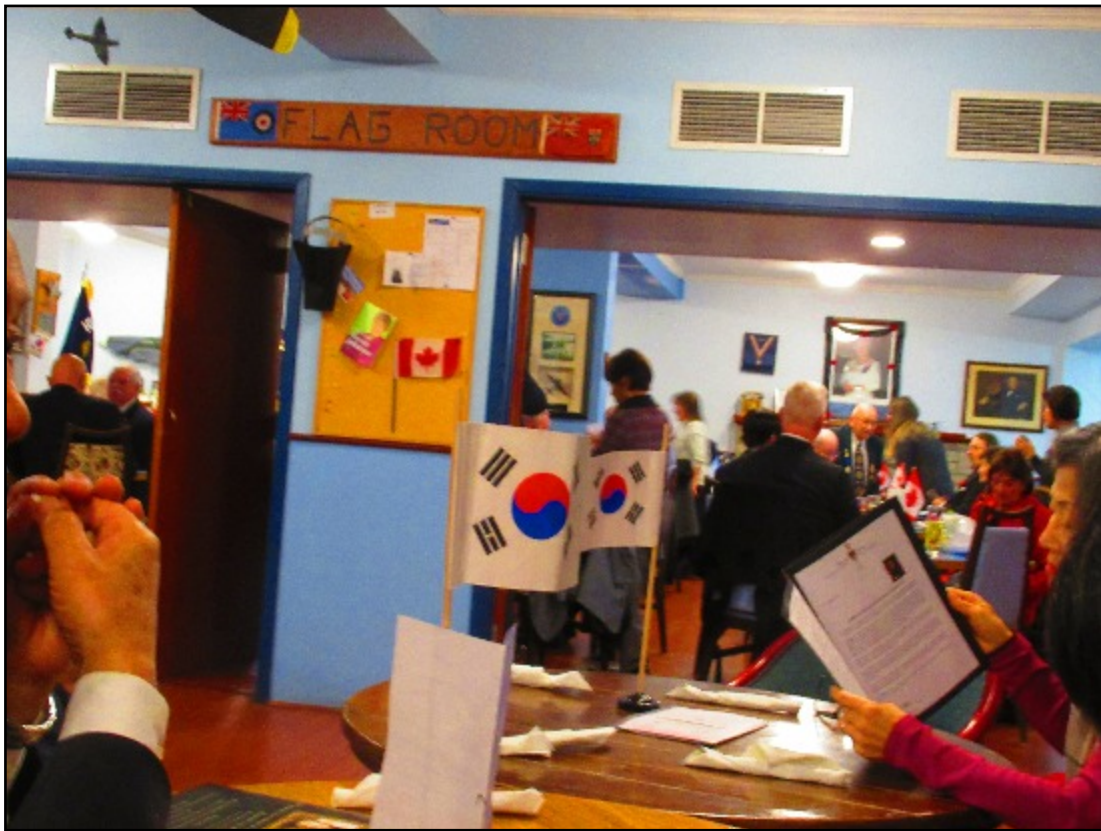
Korean War Photo Exhibition and Reception”, “Ambassador for Peace Medal” and “Republic of Korea Presidential Citation” ceremony.