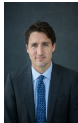
The Rt. Hon. Justin P.J. Trudeau, P.C., M.P. Prime Minister of Canada