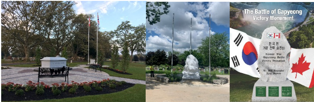
The Tomb of Unknown Soldiers erected (Sept 16, 2017) and the “Korean War Gapyeong Battle Victory Monument”

The ceremony also served as the formal unveiling of the restoration of 200 Veteran’s and War Dead graves in Fairview Cemetery's two existing Fields of Honour, as well as the development of the new Field of Honour to the west of the Tomb of the Unknown Soldier.