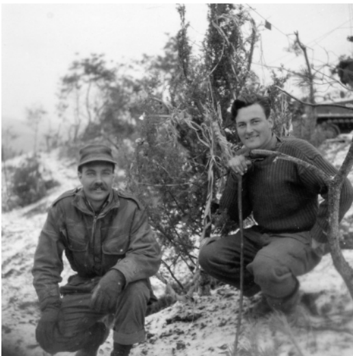
PPCLI in Korea, December 1951