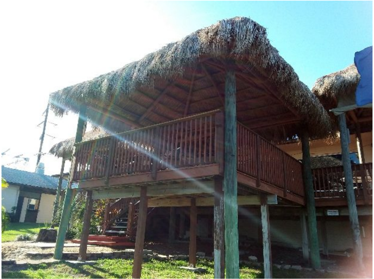
The Beautiful Patio is built by generous donors and their names are listed on the plaques.