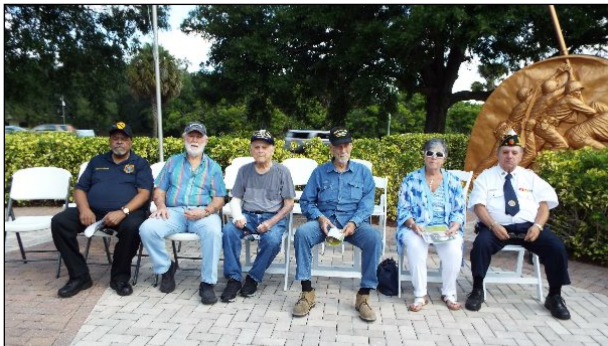
Korean War Veterans and guests.