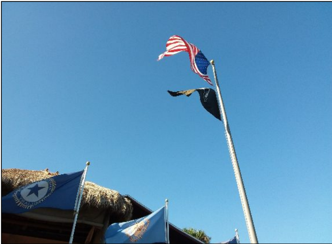
American Legion Post 8 Winter Haven is one of the most beautiful legions in Florida overlooking a lake and it is located 13 min. from the world famous “Lego Land”.