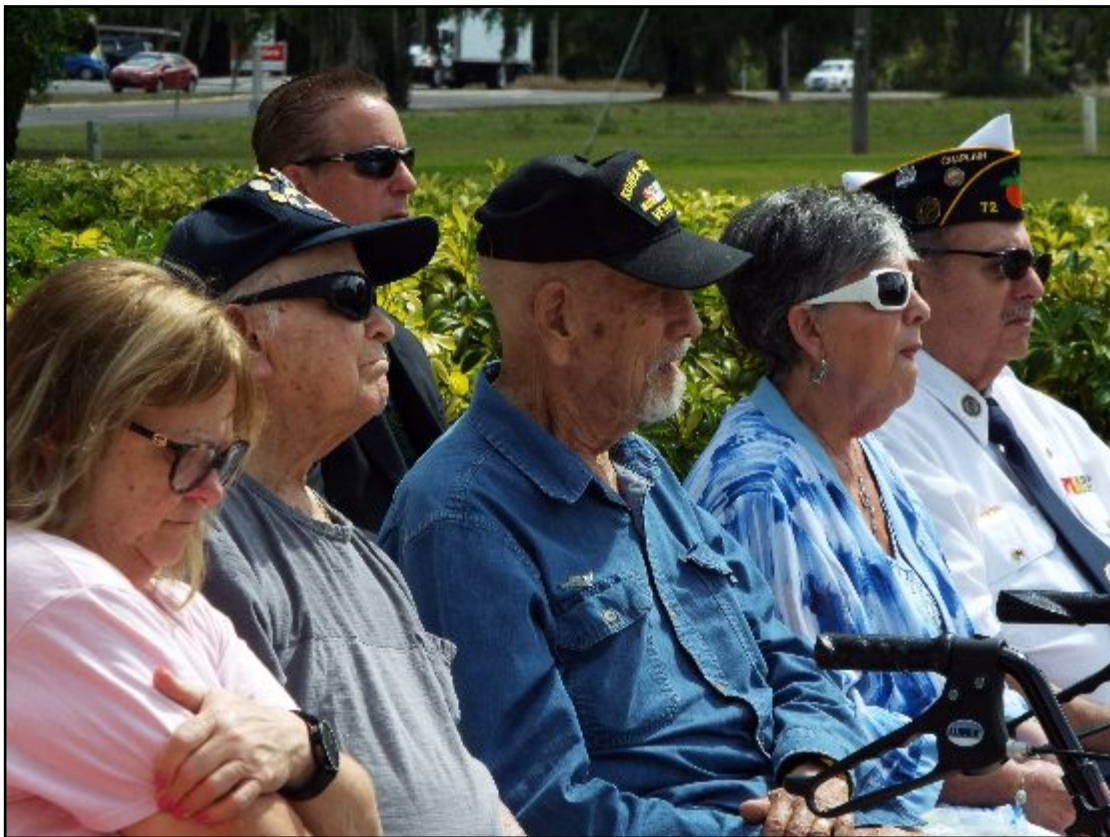
Korean War Veterans and family members at the ceremony