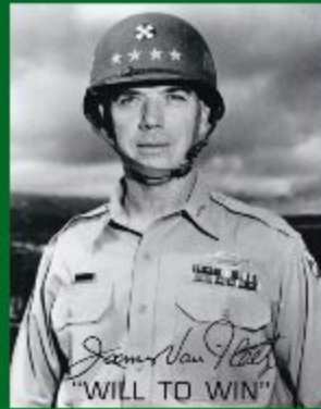
4 Star General James Van Fleet, Commander of the UN Forces during the Korean War