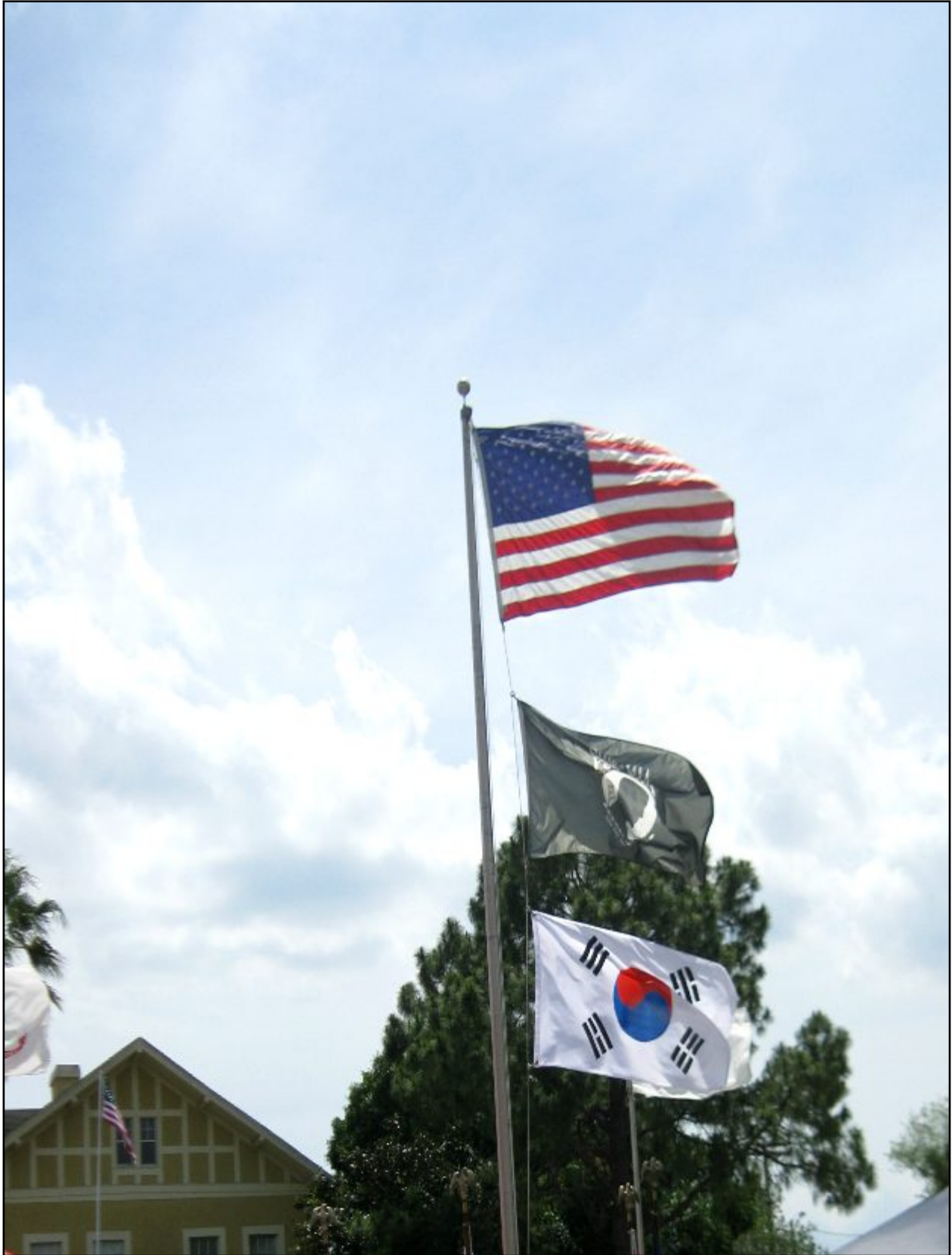
At the Korean War Monument, Frank C. Gardner & Veterans Memorial, Lake Alfred, Florida