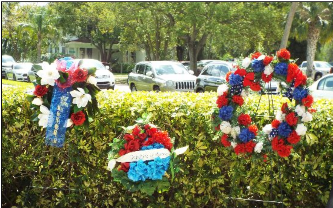
Wreaths at the “United Nations 72 nd Anniversary of the Battle of Kapyong” ceremony