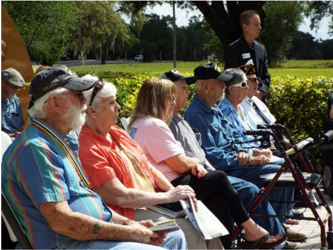
Korean War Veterans, family members and guests.