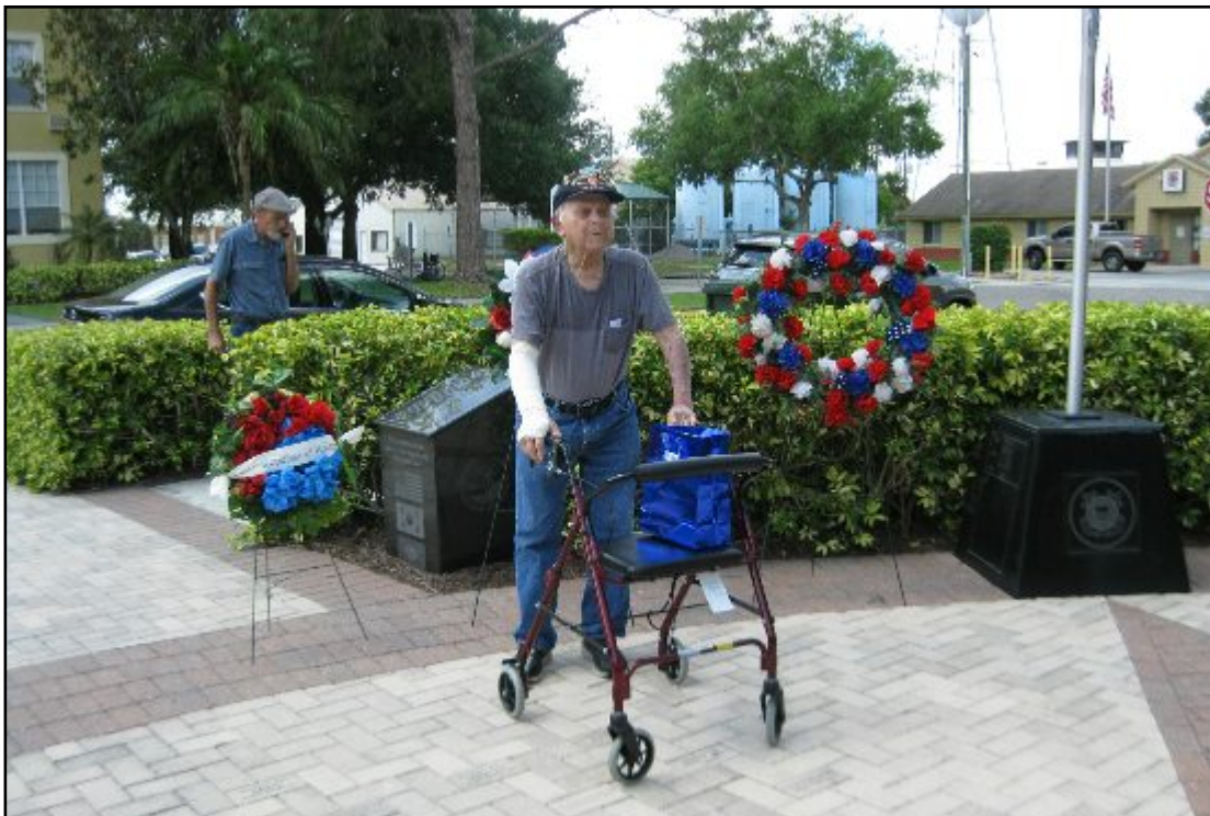
Korean War Veteran who served with the US Army, 25 th Infantry during the Korean War.