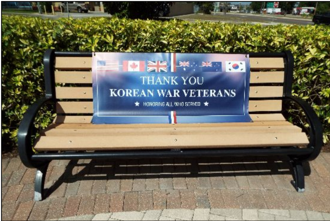
“Thank you Korean War Veterans” Banner