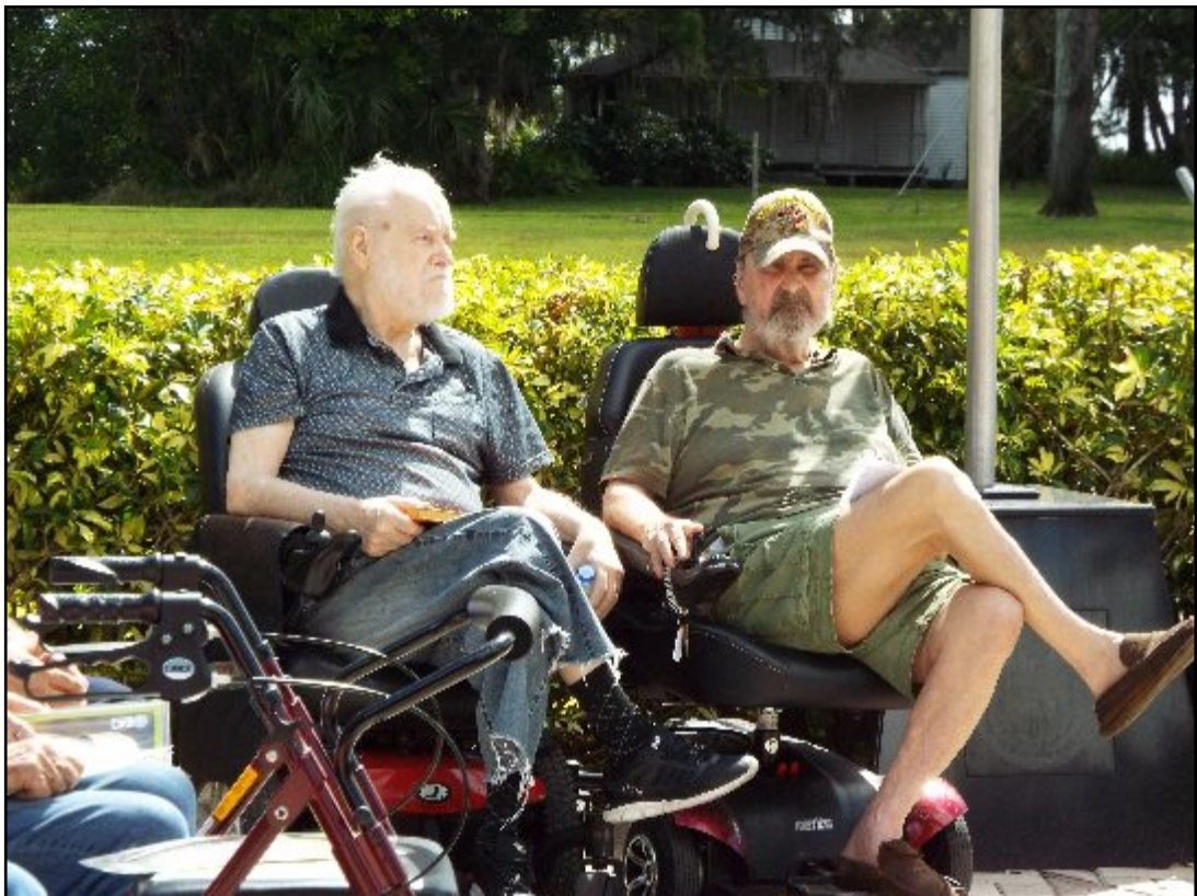
Veterans attending the ceremony.