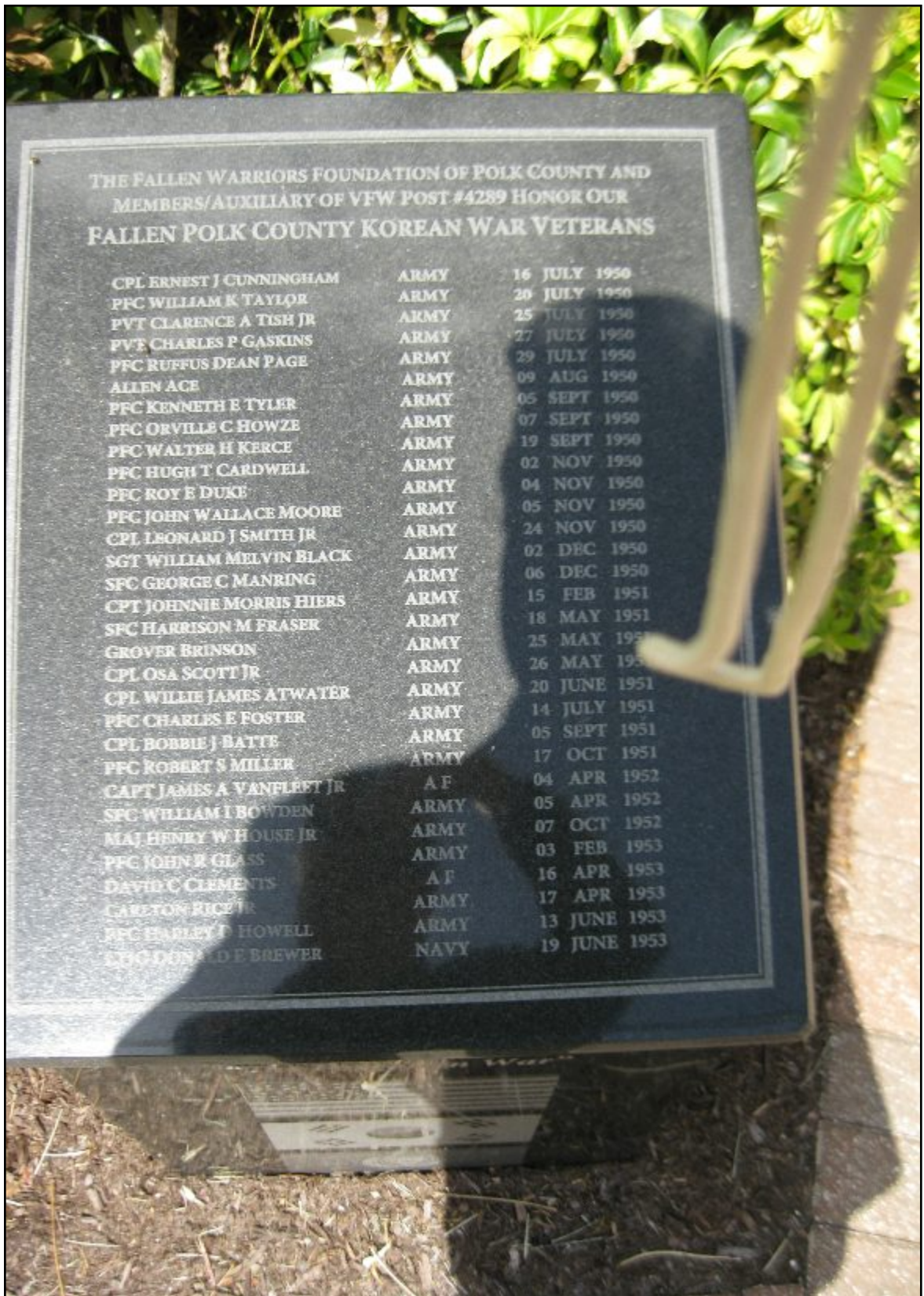
“The Fallen Polk County Veterans of the Korean War”