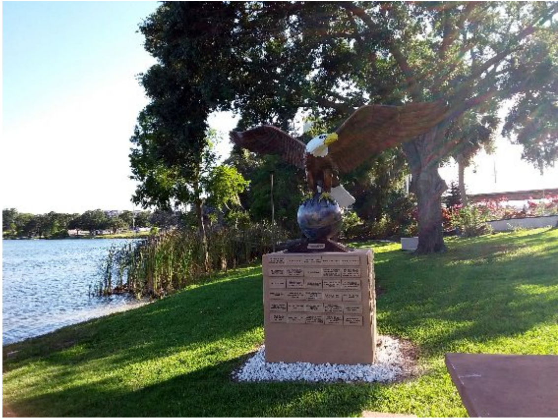
American Legion Post 8 Winter Haven's "Tiki Patio" is overlooking the beautiful lake .