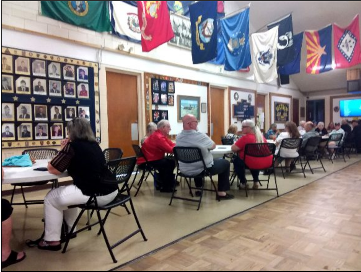
American Legion Post 8 Winter Haven has a large hall and they can host over 250 people.