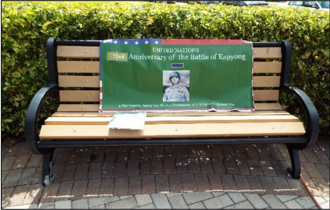
“United Nations 72 nd Anniversary of the Battle of Kapyong (now known as Gapyeong)” Banner