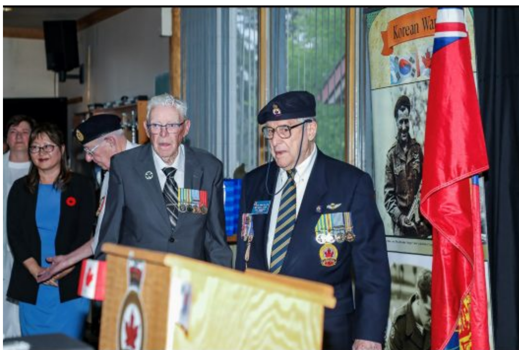
The 70th Anniversary of the Korean War Armistice – Legacy of the Korean War Veterans event took place at the Royal Canadian Legion No. 26 Col. Moore branch in Banff on Sunday (July 9).