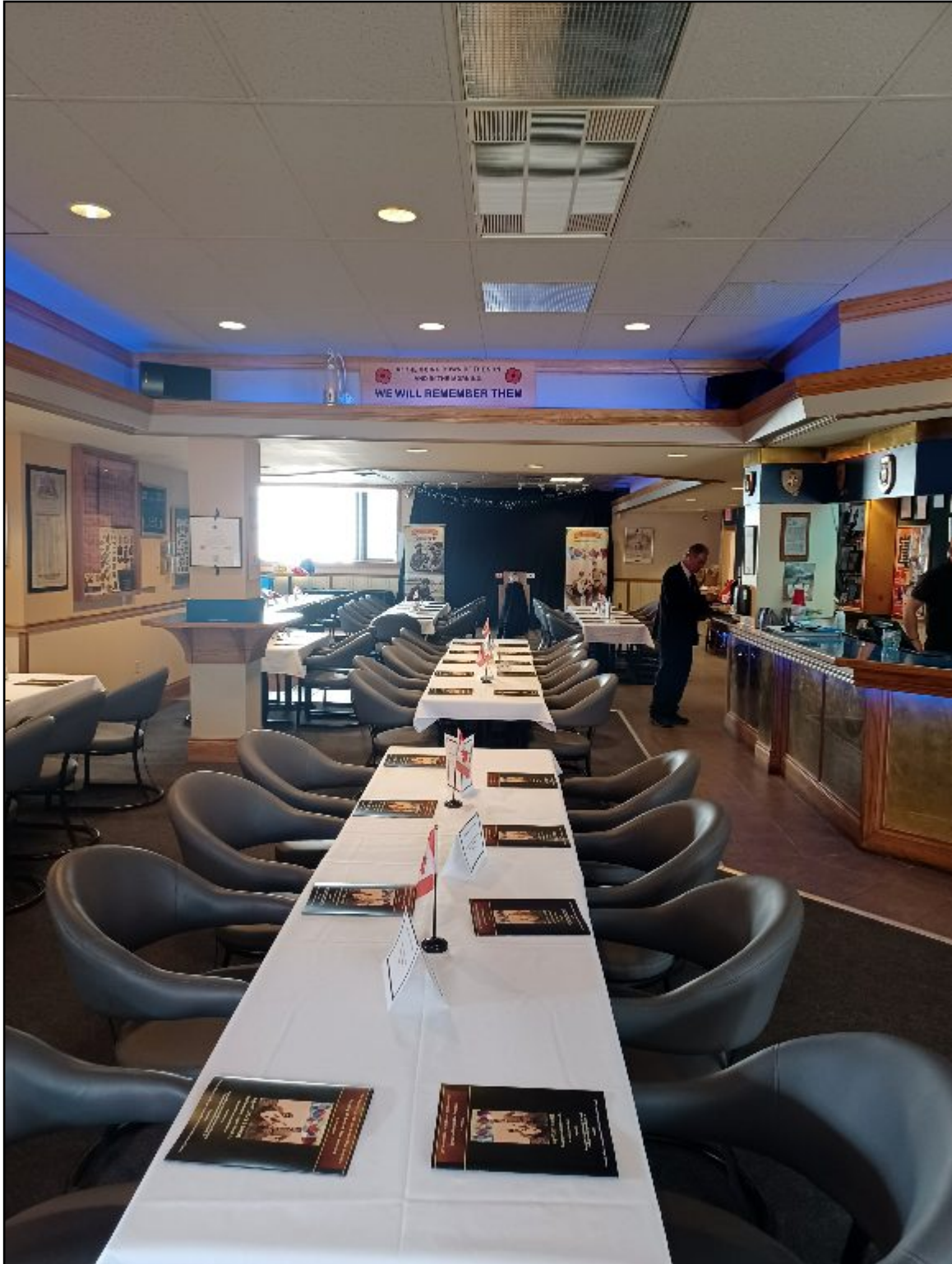
Volunteers setting up the tables for over 100 guests at the RCL Br. 26 Col. Moore Legion. They have another hall that able to host 120 additional guests in the basement.