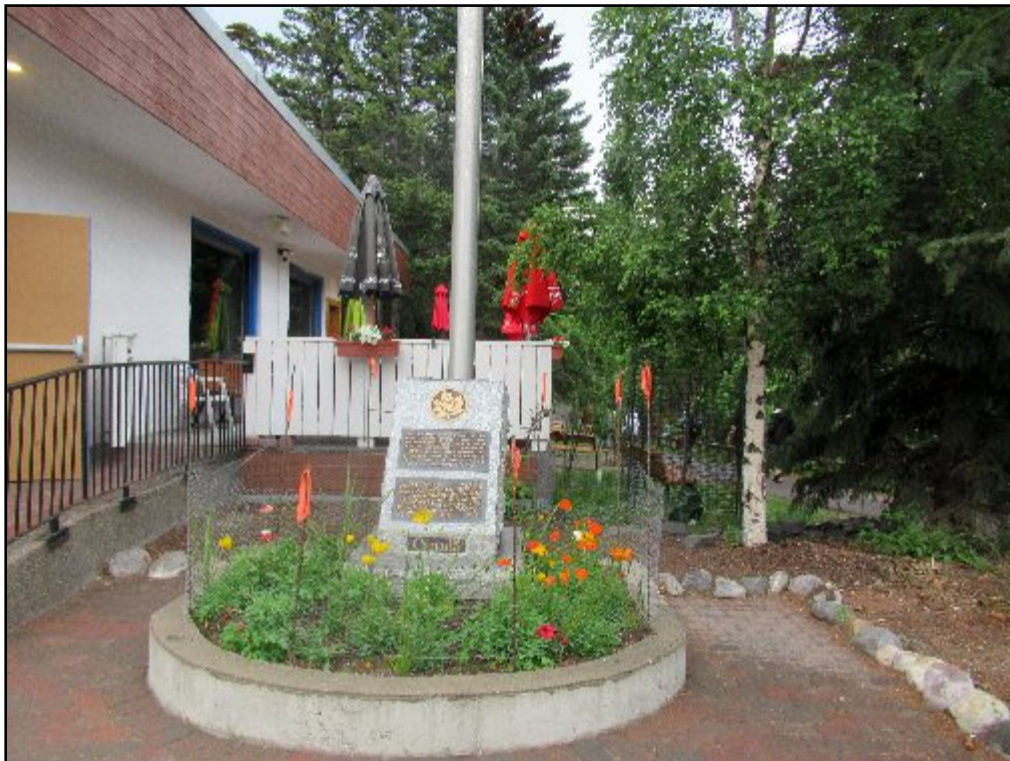
The Canadian War Memorial at the The Royal Canadian Legion Br.26 Col. Moore.