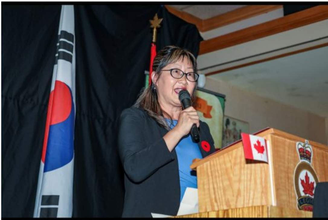
Senator Yonah Martin speaks during the 70th Anniversary of the Korean War Armistice – Legacy of the Korean War Veterans event at the Royal Canadian Legion No. 26 Col. Moore branch in Banff on Sunday (July 9).