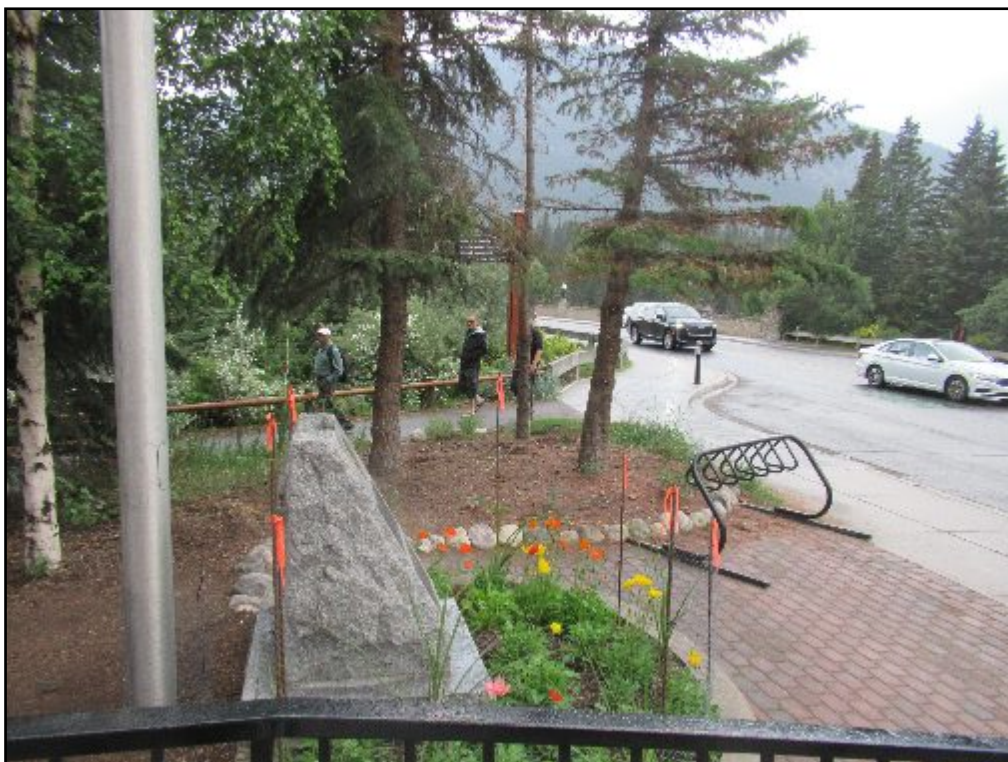
The Bow Valley Trail begins at the side of The RCL Br. 26 Co. Moore.