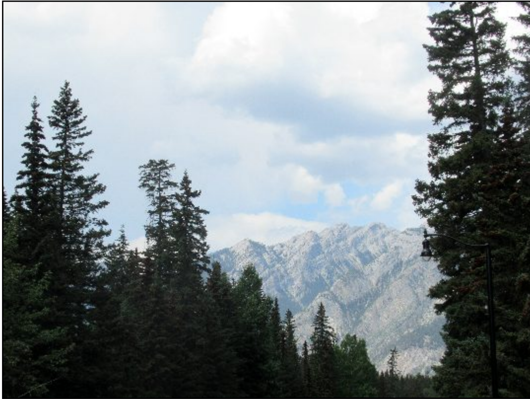
The Beautiful Rocky Mountain in Banff, Alberta Canada