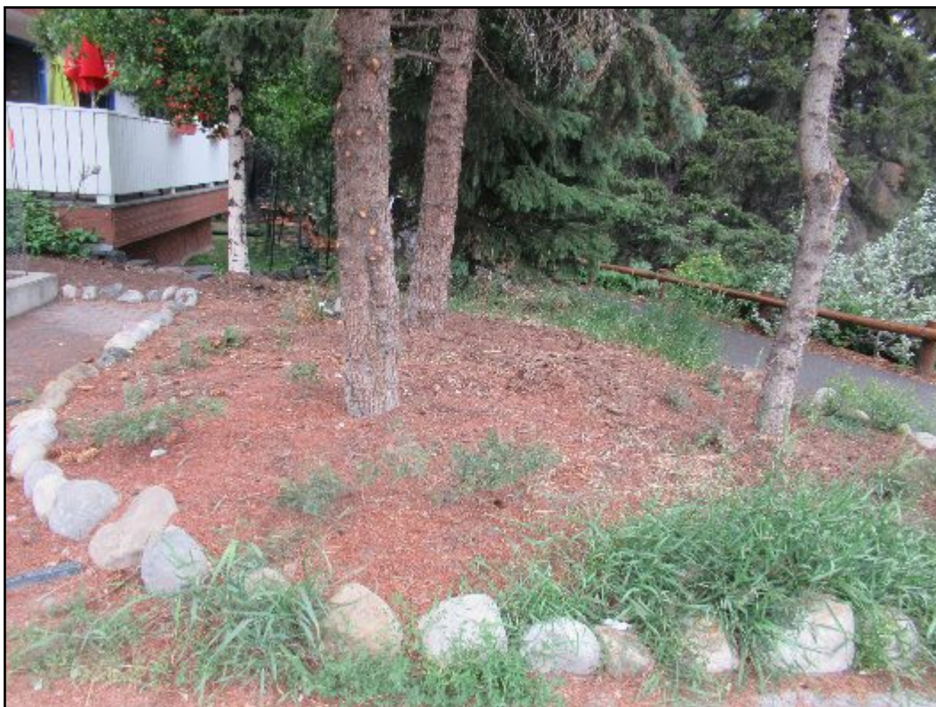
The tree garden beside of the RCL. Br, 26 Col. Moore