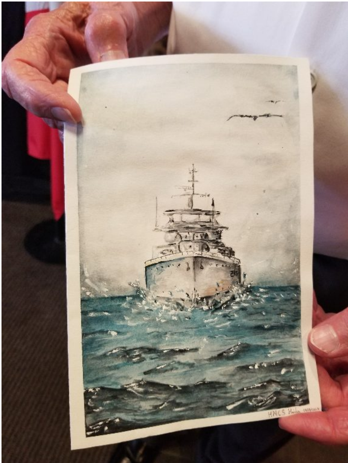
HMCS Haida is a Canada's flagship located at the harbour in Hamilton, Ontario.