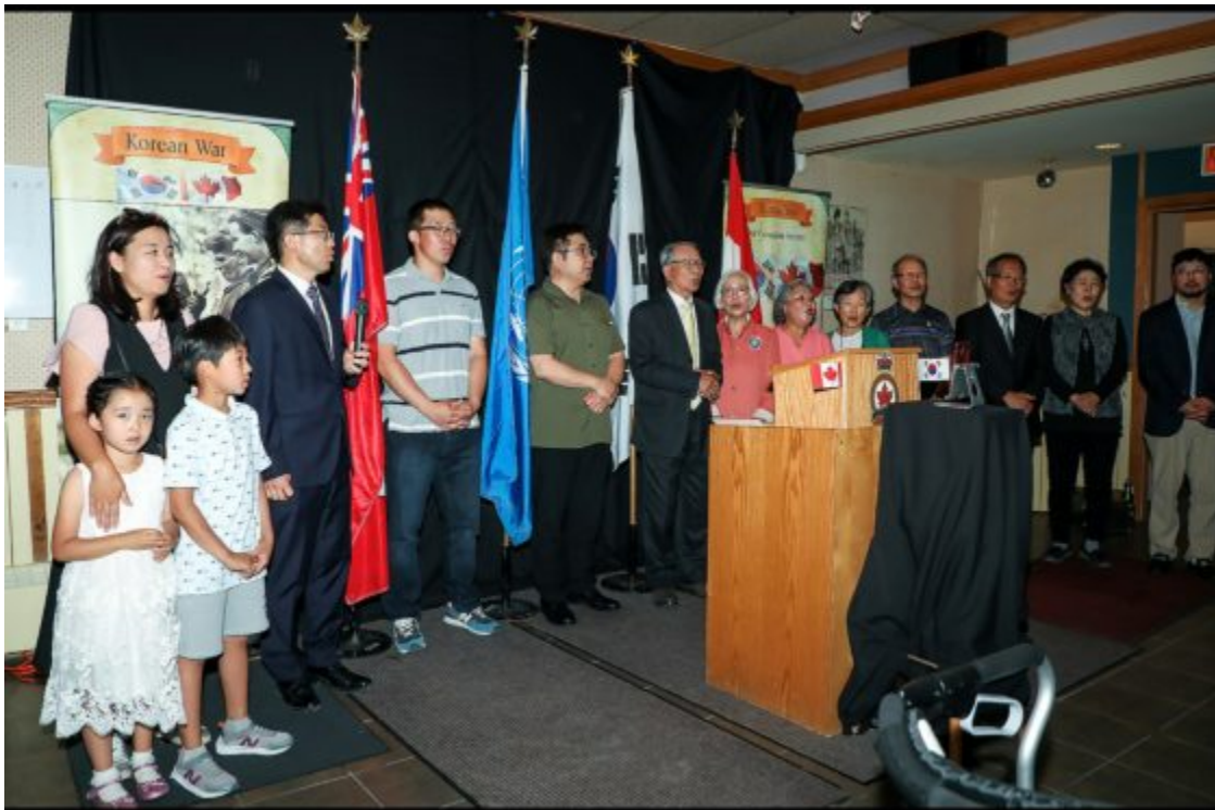
Banff Korean Church members sing Arirang, a traditional Korean song, during the 70th Anniversary of the Korean War Armistice – Legacy of the Korean War Veterans event at the Royal Canadian Legion No. 26 Col. Moore branch in Banff on Sunday (July 9).