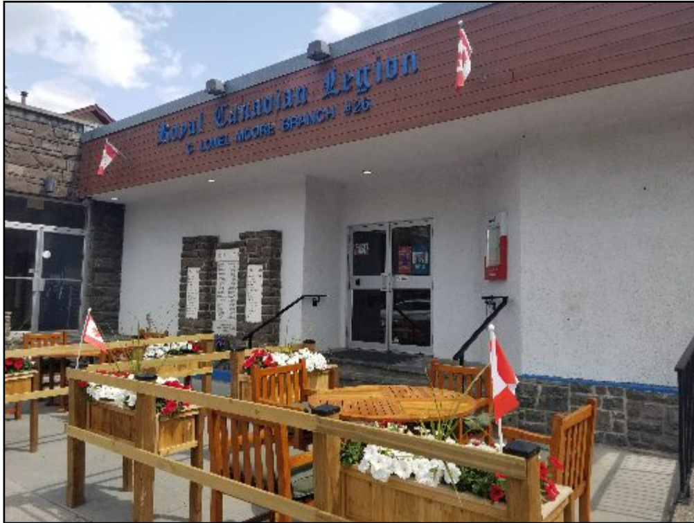
The Royal Canadian Legion Br.26 Col. Moore is located at the heart of Banff downtown.