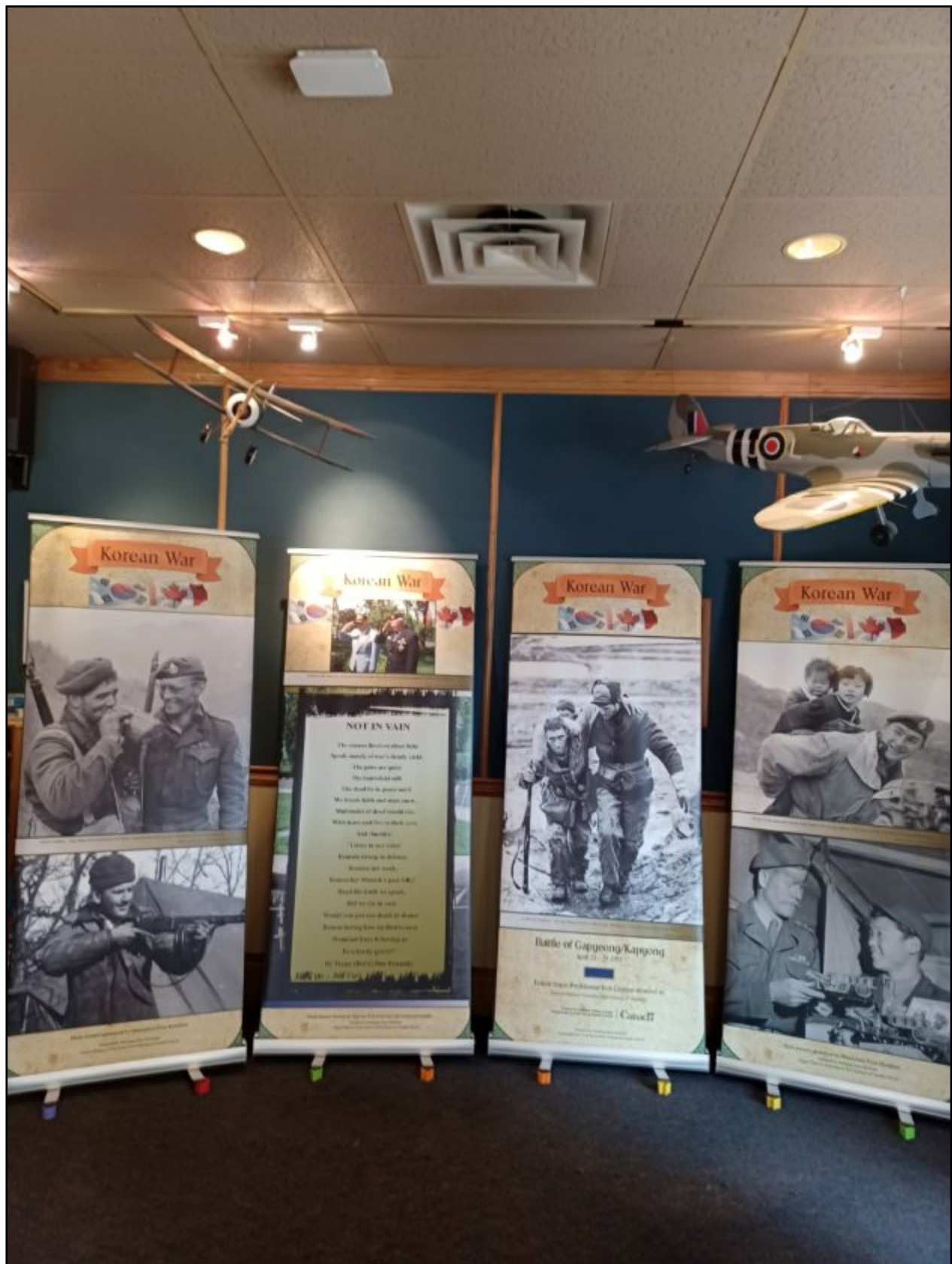
Korean War Photo Exhibition Korean War Photo banners