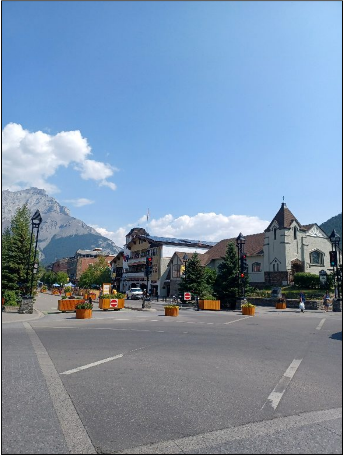
Banff Avenue is the heart of Banff downtown surrounded by beautiful Rocky Mountain.