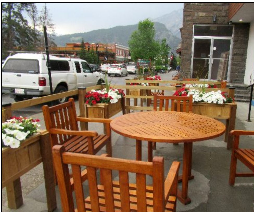
The outside patio at the Royal Canadian Legion Br. 26 Col. Moore in the heart of Banff downtown.