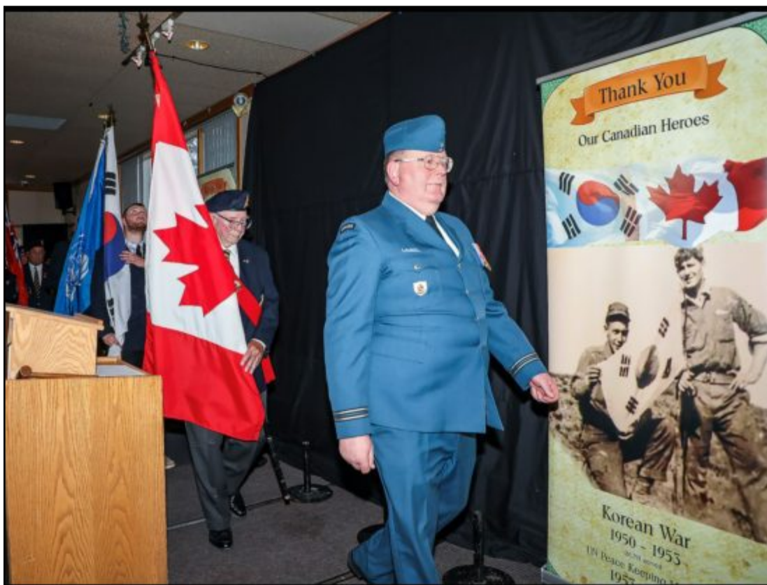
The 70th Anniversary of the Korean War Armistice – Legacy of the Korean War Veterans event took place at the Royal Canadian Legion No. 26 Col. Moore branch in Banff on Sunday (July 9).