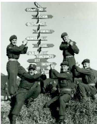
3 PPCLI in Korea - 1952