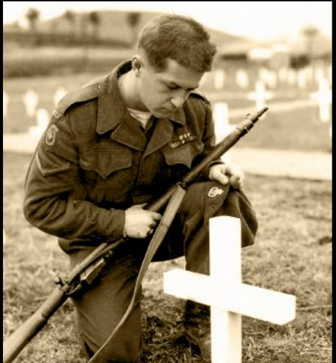
PPCLI Solder at his friend's grave site