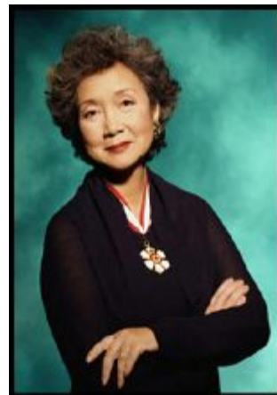
Adrienne Clarkson Colonel-in-Chief Princess Patricia's Canadian Light Infantry