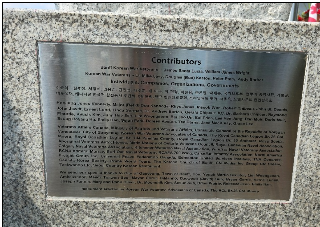
The Contributors list