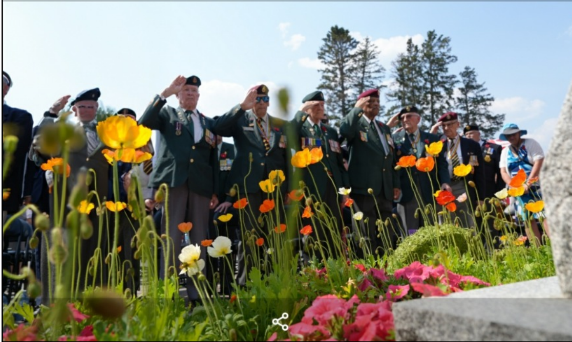
Banff Korean War Veterans at the Gapyeong Battle Victory Monument Unveiling Ceremony.