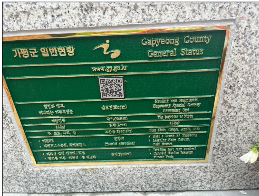
Gapyeong County, The Republic of Korea General information