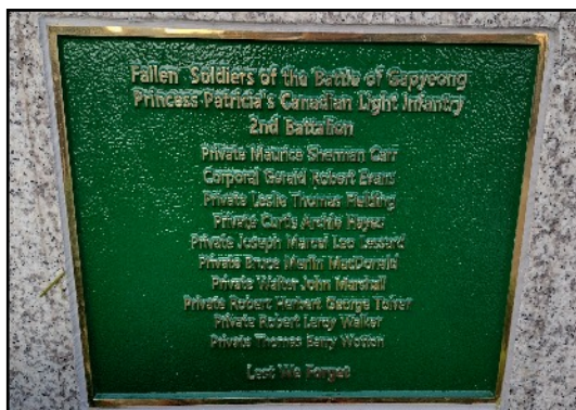
10 Names of Fallen 2PPCLI Soldiers

5 Ton Granite monument, base and 4 plaques were donated by Gapyeong County, Korea