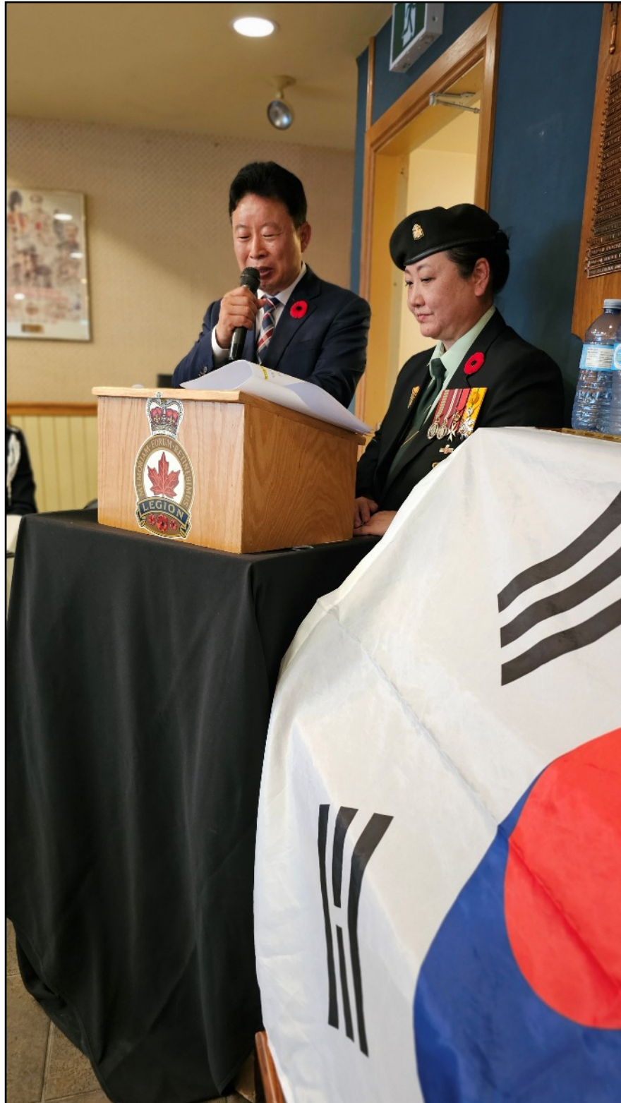
Gayeong County Mayor Teawon Seo and Gapyeong County donated a total of 6 Gapyeong Stones to Canada including Banff to honour and remember Korean War Veterans and help to strengthen the diplomatic relations between Canada and Korea.