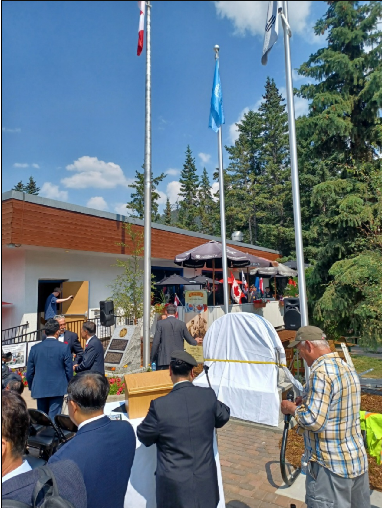
Guests at the Banff Korean War Gapyeong Battle Victory Monument.