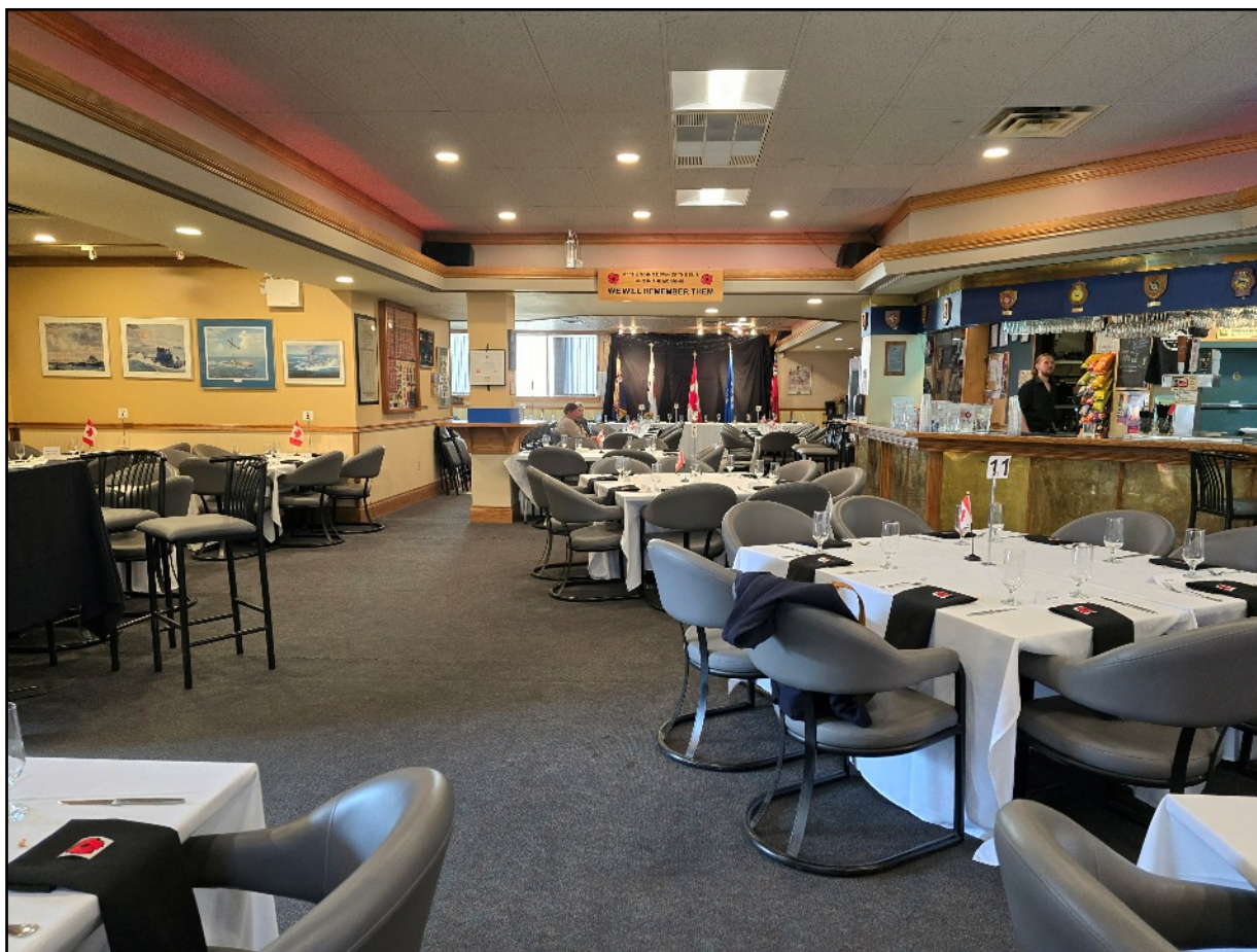
The Veterans Appreciation Dinner after the “Banff Korean War Gapyeong Battle Victory Monument” Unveiling Ceremony was organized the Korean War Veterans Advocates of Canada at the Royal Canadian Legion Br. 26 Col. Moore on July 21 st , 2024 with great help from our volunteers and Executives and the staff of The RCL Br.26 Col Moore.