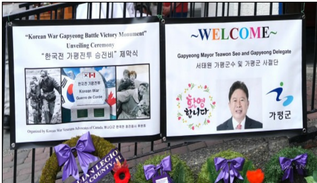
Banners at the Gapeyong Battle Victory monument unveiling ceremony.