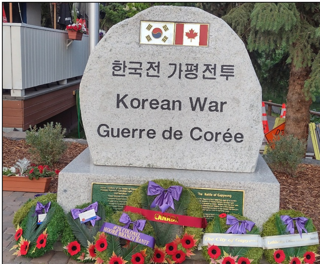
“Banff Korean War Gapyeong (previously known as Kapyong) Battle Victory Monument”

5 Ton Granite monument, base and 4 plaques were donated by Gapyeong County, Korea